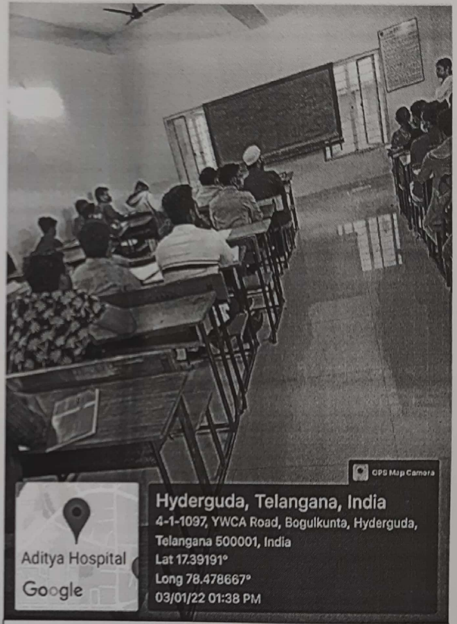
Class Room No: A-102

Hyderguda, Telangana, India 4-1-1090, YWCA Road, Bogulkunta, Hyderguda, Telangana 500001, India Lat 17.39193° Long 78.478639° 03/01/22 01:38 PM