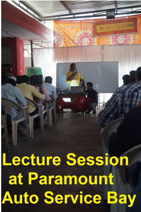
Lecture Session at Paramount Auto Service Bay