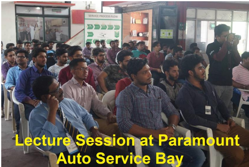
Lecture Session at Paramount Auto Service Bay